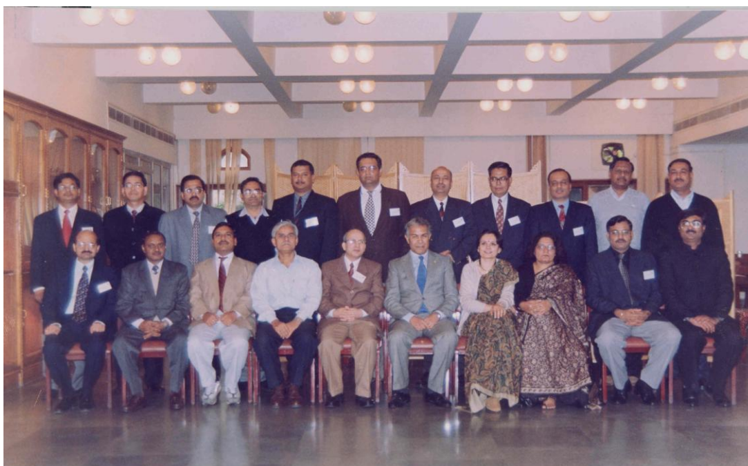
In-service Training Programme for IAS Officers (17-20 Years) (09 – 20 September, 2002)