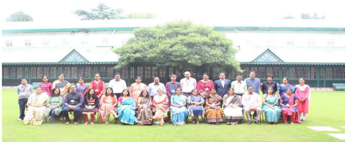
Group Photo of the program