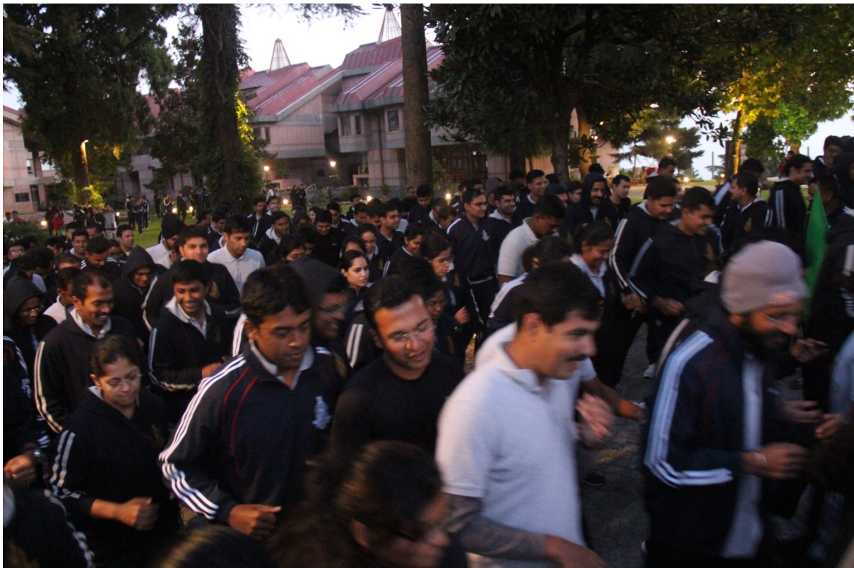
92nd Foundation Course- Cross-Country Race