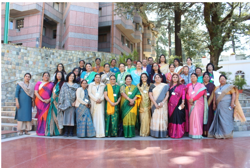
Group Photo of the program