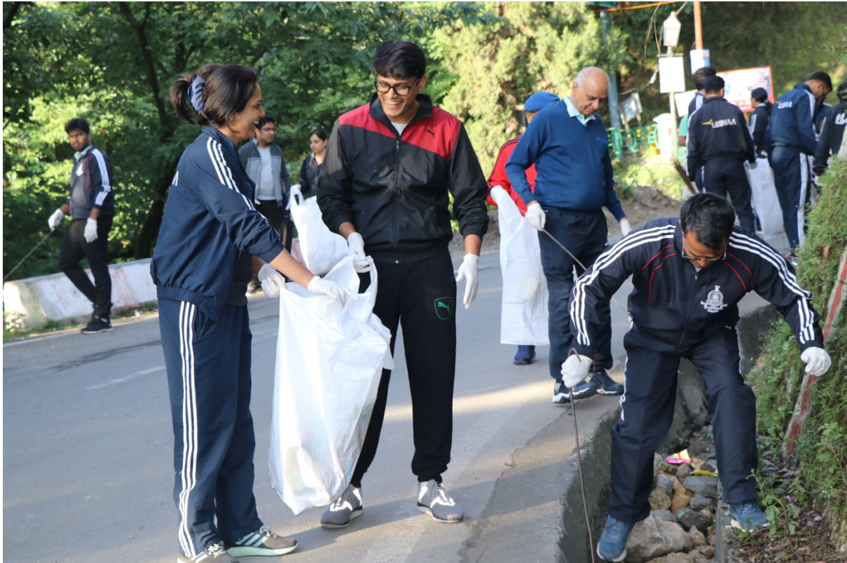
92nd Foundation Course - Officer Trainees in Shramdan