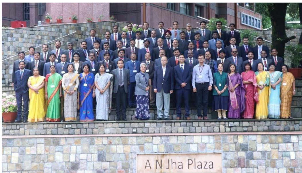
119 th Induction Training Programme for SCS- Validitory Ceremony