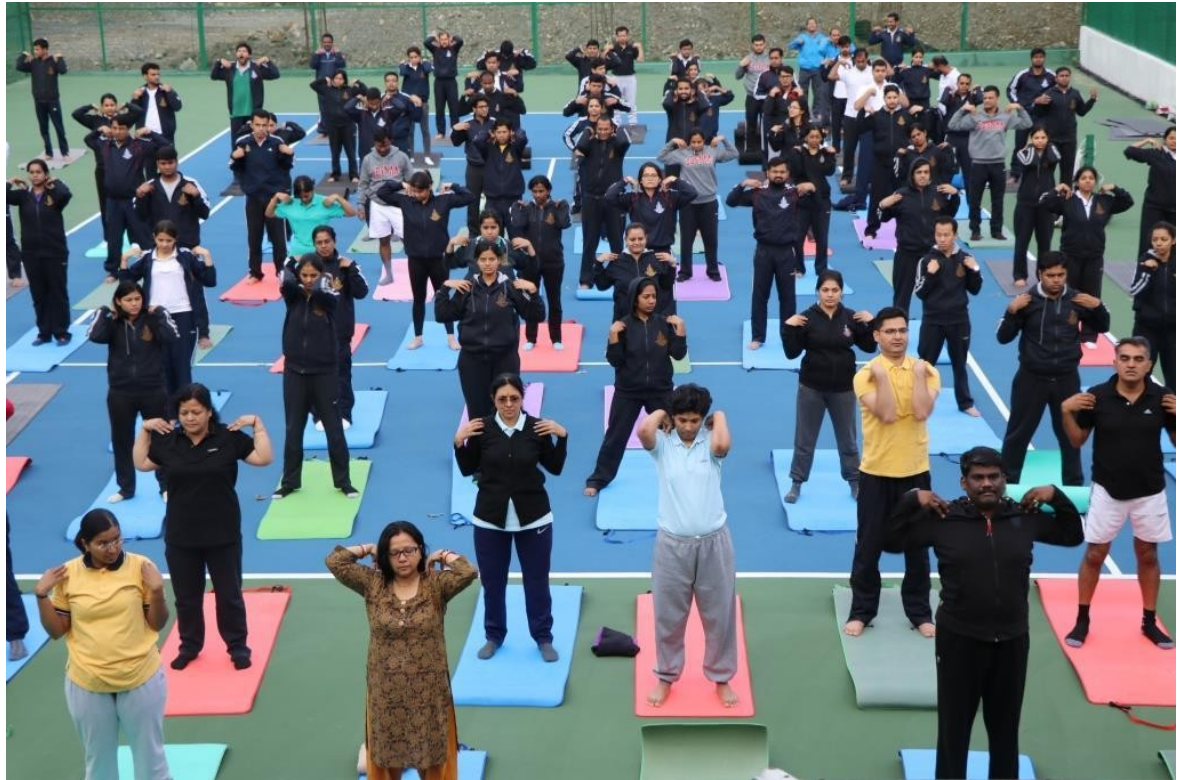
Yoga at the Academy on International Yoga Day on June 21, 2017