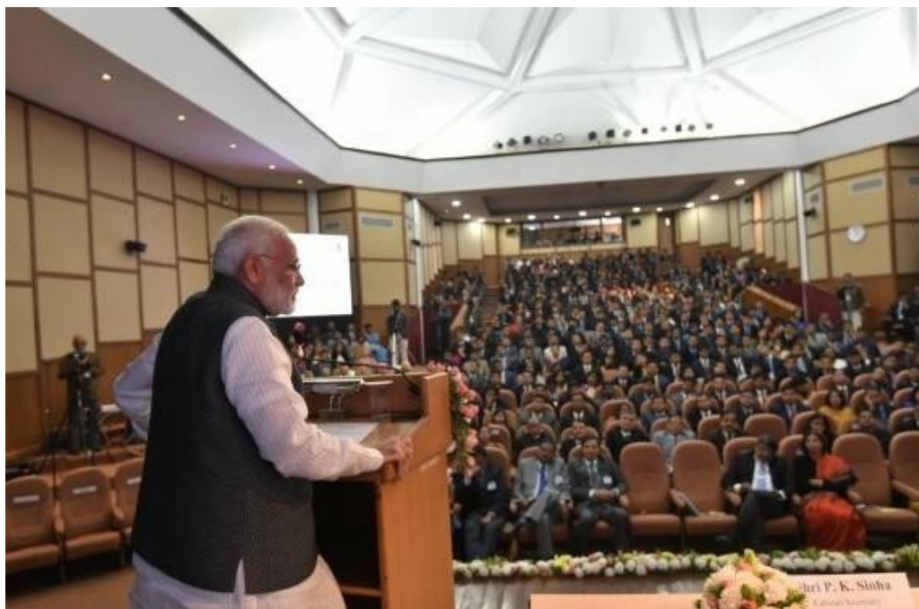
Prime Minister Shri Narendra Modi addressing Officer Trainees at LBSNAA