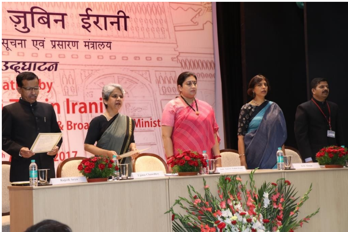
92 nd Foundation Course -Inaugural Ceremony