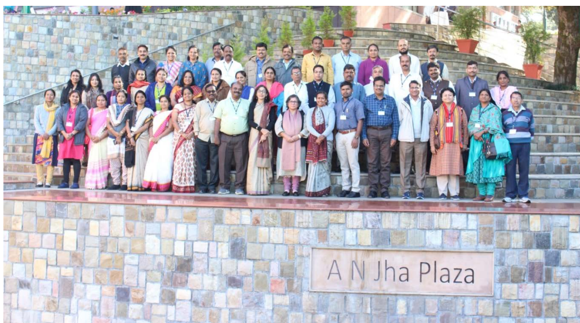
Group Photo of the program