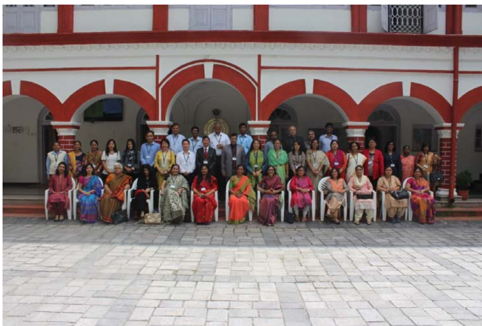
Group Photo of the program