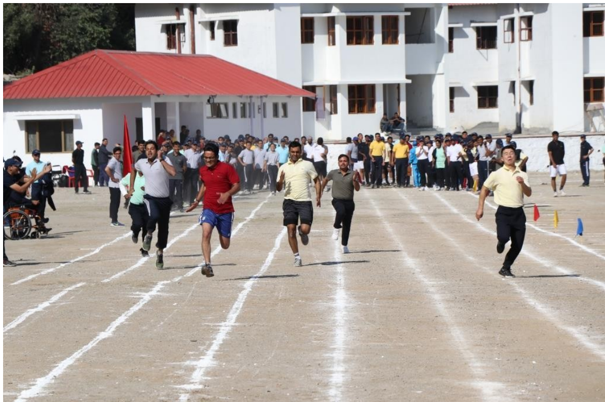
92 nd Foundation Course-Athletic Meet